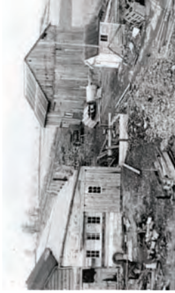
Left: First year, 1941 original farm house. Right: First dairy barn addition and milk house, circa 1945.