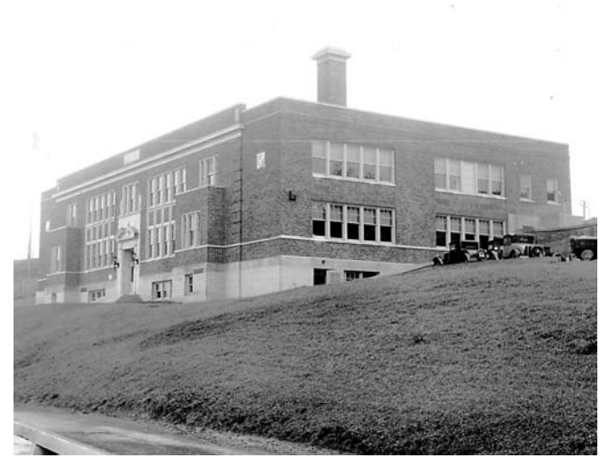
The new Gilboa-Conesville Central School