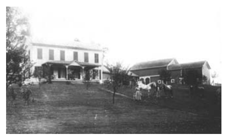
Photo of the original Fink's Hotel (left) and its reincarnation as the Wilson farmhouse