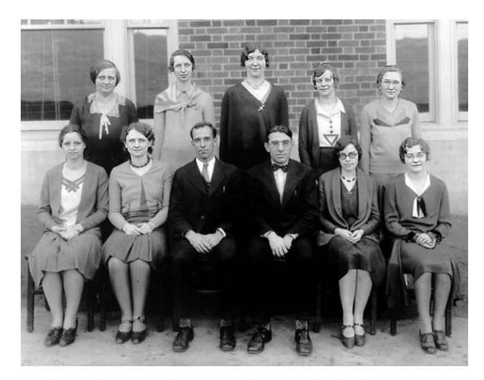
Teachers at the new Gilboa-Conesville Central School